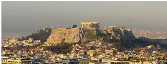
Acropolis at dawn

Religion was an essential part of life in Athens. Many houses had an altar for family prayers in the open courtyard. The most important public and religious event was the 'Great Panathenaea', the feast of the goddess Athene. It was held every 4 years, with less important festivals in-between, and lasted for 6 days. Athene, the daughter of Zeus, was the goddess of wisdom, her symbol was an owl. She was also the patron* goddess of Athens. The most important part of the festival was a huge procession. It started at the city wall, led across the Agora on the Panathenaic Way up to the Acropolis. There, a specially made dress was offered to a