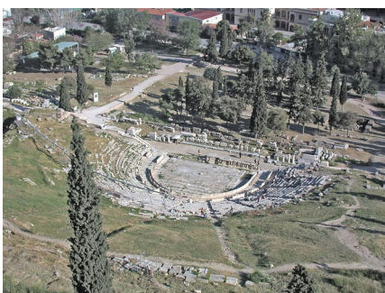
Image 2: Dionysus theatre, seen from the Acropolis

Citizens over thirty years old did not only attend the ekklesia and served as councillors, but were also expected to serve in the various courts. They were chosen by lot and paid to make up for any loss of earnings. As there were no lawyers*, a citizen had to speak for himself in court.